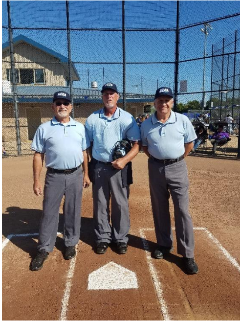
Division 4 Championship Crew 2018