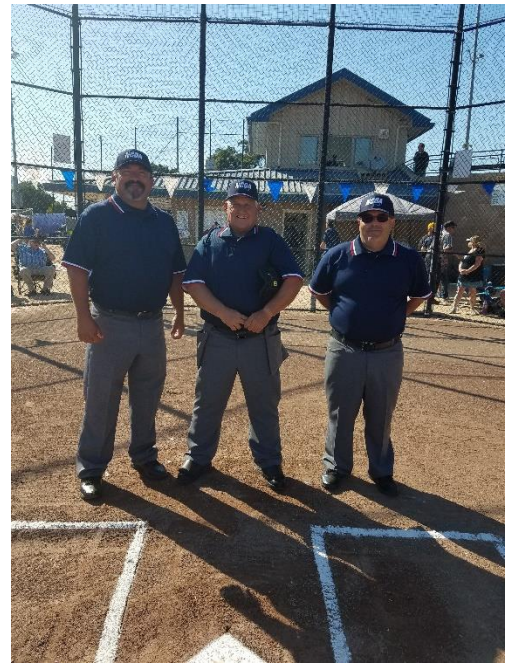
Division 2 Championship Crew 2018